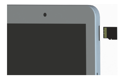
Figure 4. Inserting and Retrieving a Micro SD Card