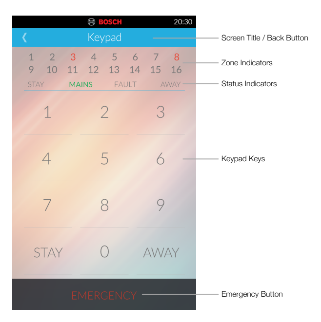
Figure 2. Keypad Screen

Figure 2 shows the TouchOne Keypad Screen. This allows you to perform system functions that do not have a graphical interface on the TouchOne. Please refer to the "Operation with ICON LCD Codepad" section in the Control Panel User Guide for instructions on performing these functions on this screen.